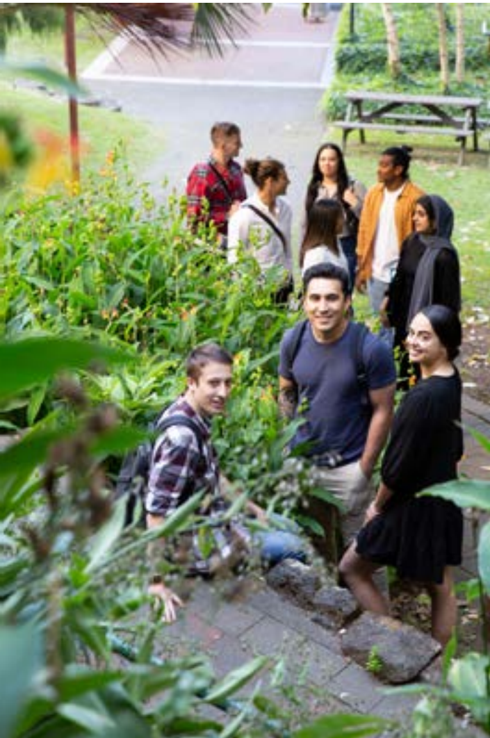
The Auckland Law School is grateful for the support of James & Wells and AJ Park for assisting with our courses in 2022.

Our courses are taught by leading researchers in the area of intellectual property in combination with outstanding intellectual property practitioners and professionals.