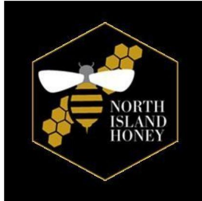
Image description BEE, STYLISED & HONEYCOMB IN HEXAGON